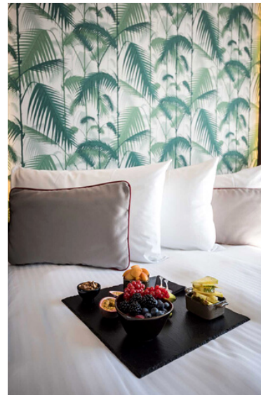
Milan. Hotel Manin

International roundtrip airfare; travel insurance; transportation to the trip's starting point; activities not included; hotel incidentals including room service, laundry service and hotel bar tabs; food and beverage not included