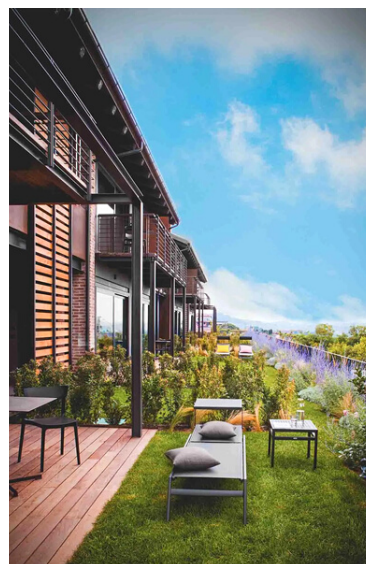
Langhe, La Morra, Arborina Relais

International roundtrip airfare; travel insurance; transportation to the trip's starting point; activities not included; hotel incidentals including room service, laundry service and hotel bar tabs; food and beverage not included