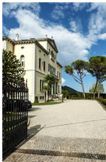
Treviso, Villa Soligo Charming Hotel

International roundtrip airfare; travel insurance; transportation to the trip's starting point; activities not included; hotel incidentals including room service, laundry service and hotel bar tabs; food and beverage not included