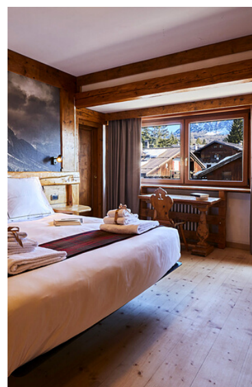
Cortina, Hotel Europa

International roundtrip airfare; travel insurance; transportation to the trip's starting point; activities not included; hotel incidentals including room service, laundry service and hotel bar tabs; food and beverage not included