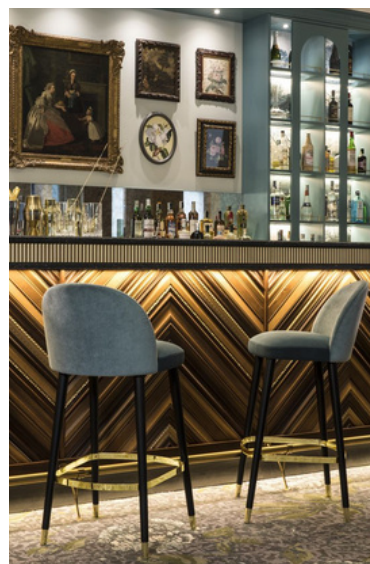
Verona, Boutique Hotel Indigo

International roundtrip airfare; travel insurance; transportation to the trip's starting point; activities not included; hotel incidentals including room service, laundry service and hotel bar tabs; food and beverage not included