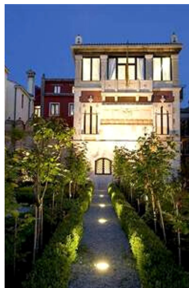
Venice, Ca' Nigrà Resort & Spa

International roundtrip airfare; travel insurance; transportation to the trip's starting point; activities not included; hotel incidentals including room service, laundry service and hotel bar tabs; food and beverage not included