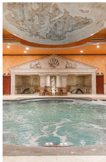
Valpolicella, Villa Quaranta Wine Hotel & Spa

International roundtrip airfare; travel insurance; transportation to the trip's starting point; activities not included; hotel incidentals including room service, laundry service and hotel bar tabs; food and beverage not included